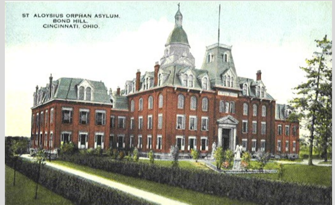
Postcard showing main building (1856-61) and wings (1869).

The nomination documents that in 1953, the building exterior's soft brick was deteriorating, and Perma-Stone was added. The color chosen closely matched the orphanage's 1923 limestone chapel. Although the application covered brick walls and stone lintels and sills, important character-defining features of the exterior design were maintained by the historic institution. In addition to the mansard roof with its cornice brackets and dormers, the pedimented entrance survives along with historic window openings. The historic context describes a major remodeling of the orphanage within the period of significance. As the area of significance is social history, not architecture, the original nineteenth century design was not the reason for listing, providing greater latitude in assessing integrity.