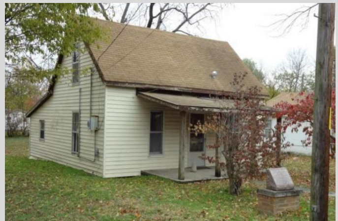
Before porch, lean-to, and contemporary siding removal, 2012.