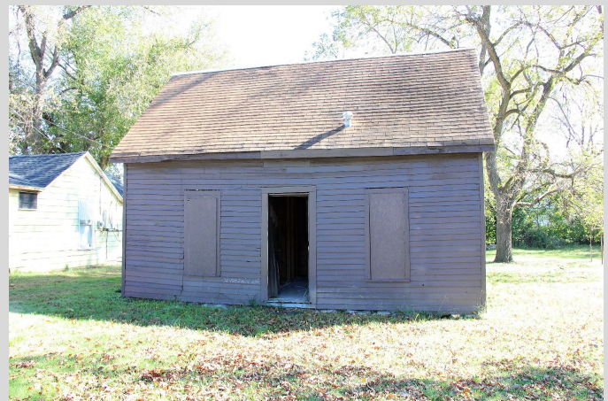
After initial rehabilitation work, c. 2016.

The National Register of Historic Places