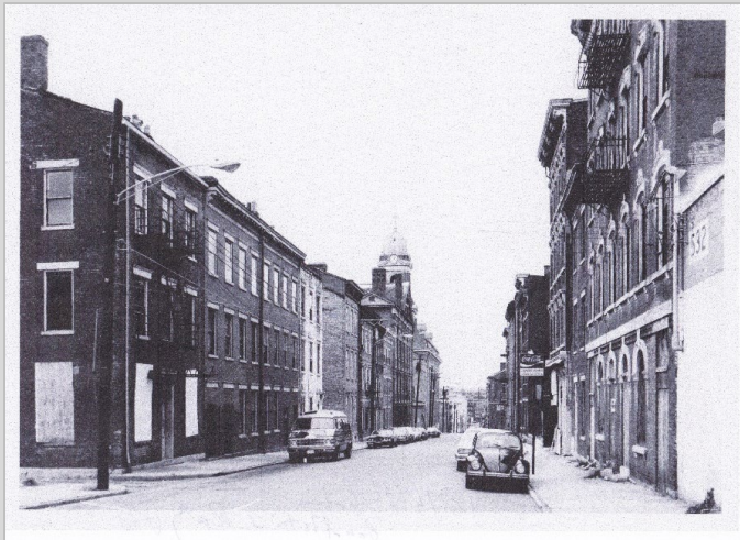
12th Street between Pendleton and Reading Road, 1983.

National Register if the significant form, features, and detailing are not obscured.