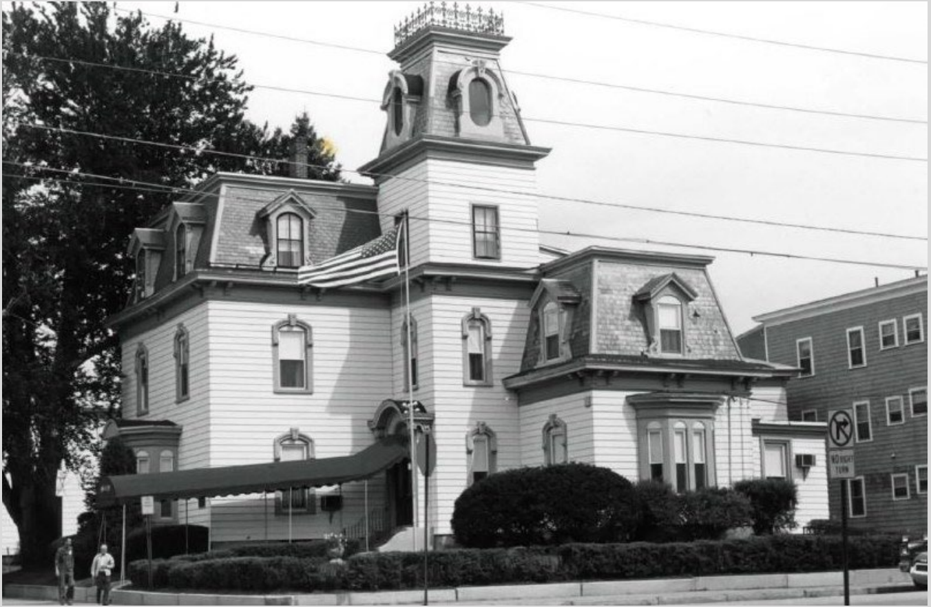
View of Wedgewood House, 1985.