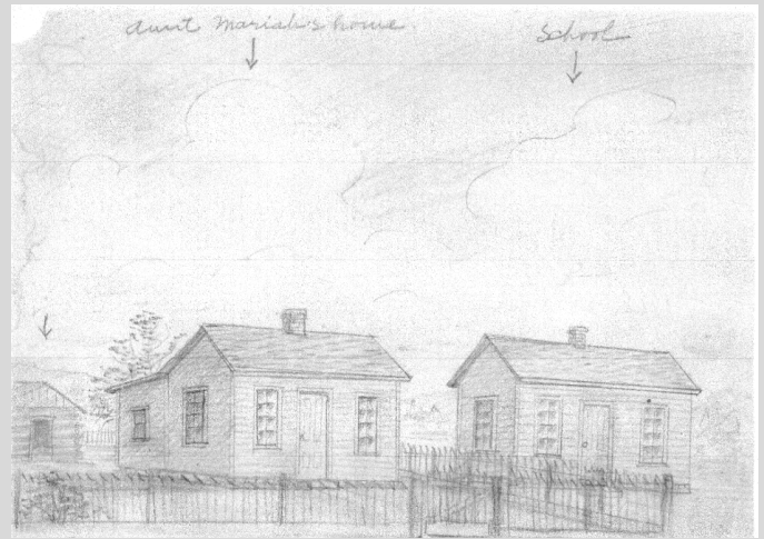
Sketch by George Washington Carver, c. 1939. The house on the left is no longer extant.

Because of the rarity of the resource and its ability to still convey its historic use as a school—due to its restored form and fenestration, and surviving wood siding—and as a rare surviving African American school that is also associated with George Washington Carver, the property was individually listed in the National Register in 2017.