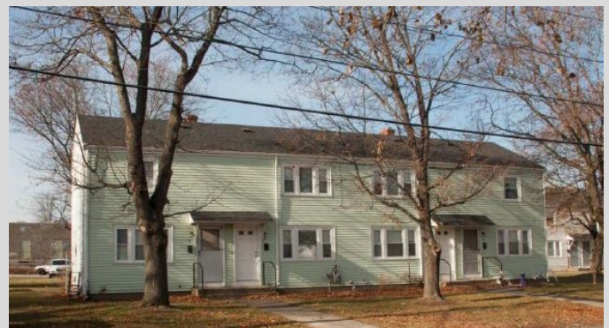
Typical housing types.