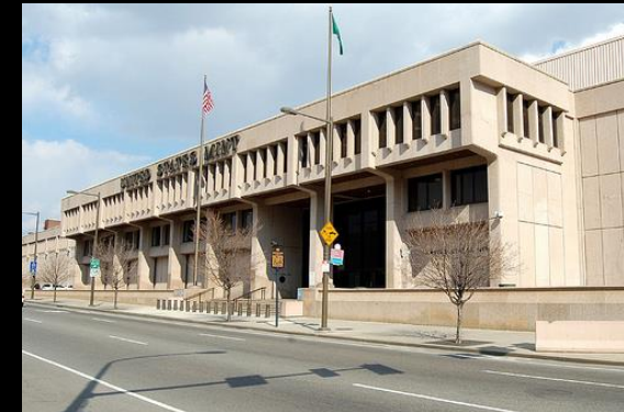
U.S. Mint Philadelphia, c.1968