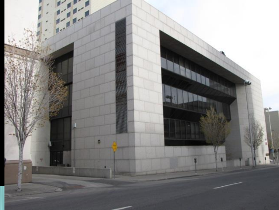
Farm Credit Bank Spokane, 1970