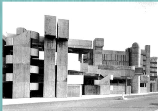
Tricorn Wholesale Market Owen Luder Portsmouth, England, 1965