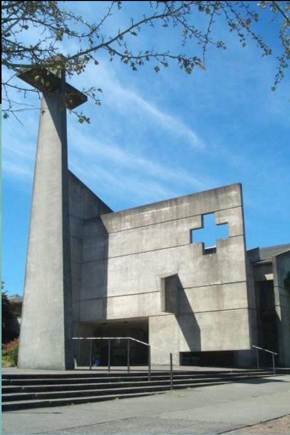
Christ Episcopal Church, Tacoma, 1970