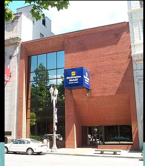
Bank of California Annex Tacoma, 1964