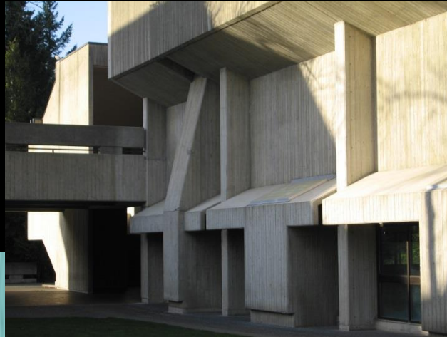
Student Activity Center – Evergreen State, Olympia, 1972