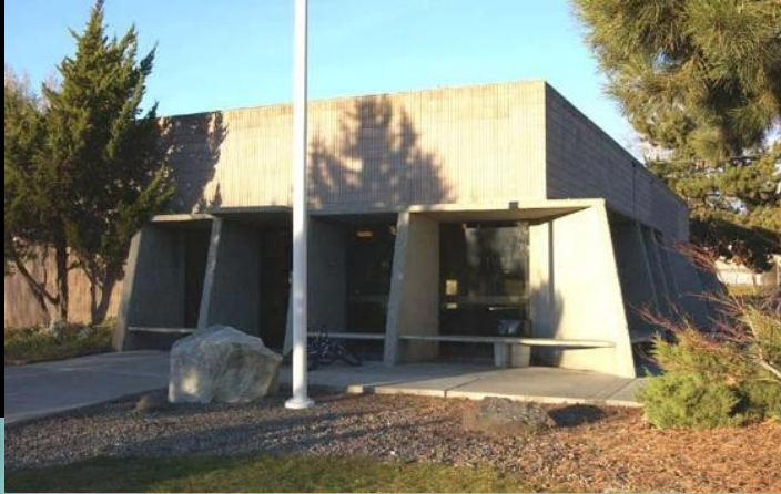
Prosser Public Library, Prosser 1972