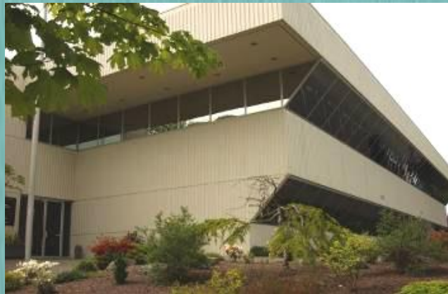
IBM Building Business Space Design, Olympia, 1975