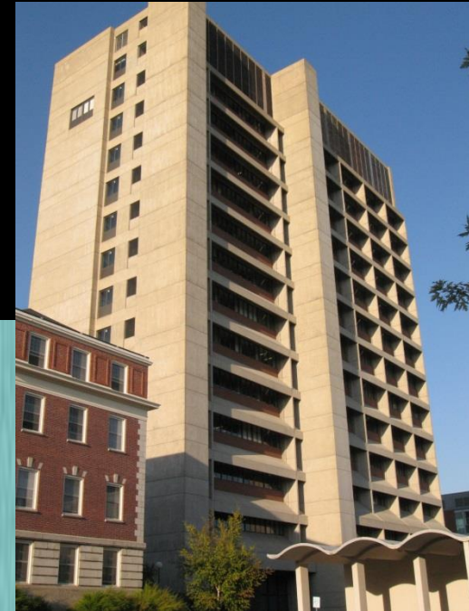
Physical Sciences Building – WSU, Pullman, 1973