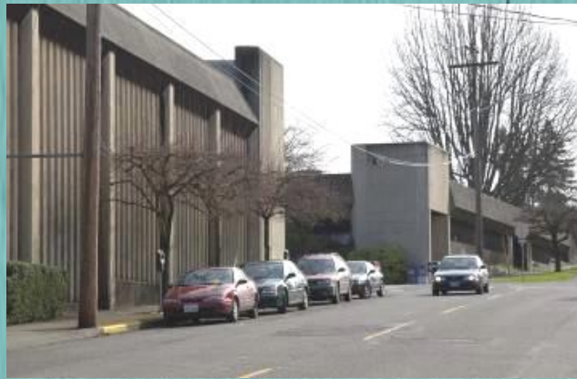
State Parking Garage, Olympia, 1958