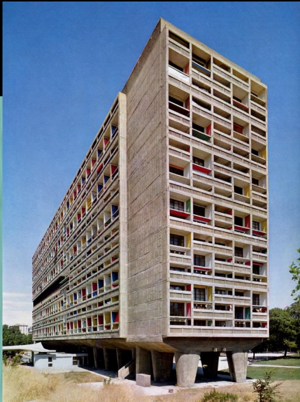
Unite d' Habitation Le Corbusier, Marseilles, France, 1946-52