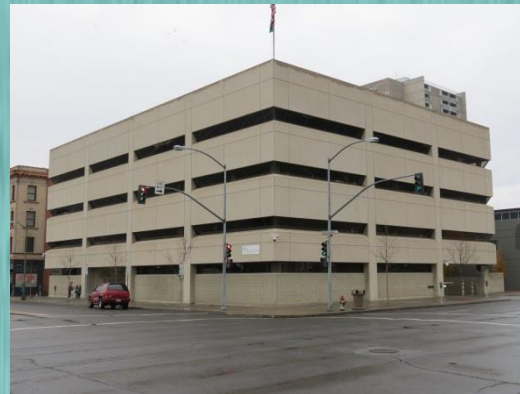
Dist. 81 Administration Offices Spokane, c.1978