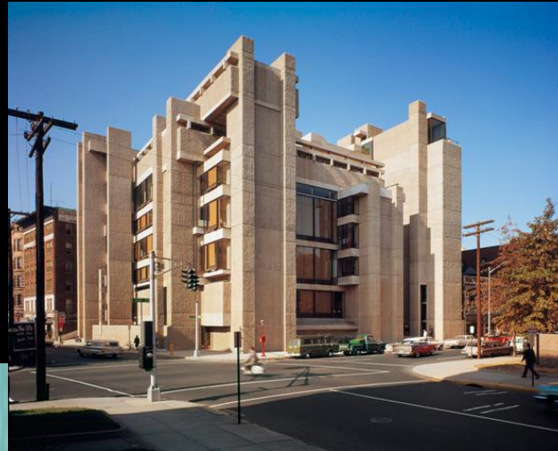
Art & Architecture School – Yale Paul Rudolph New Haven, 1963