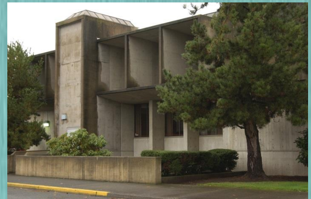
First National Bank Enumclaw, c.1971