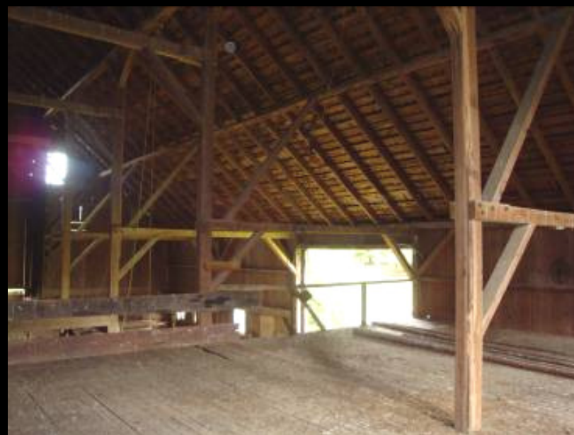
McCormick Barn, Ridgefield – c.1915