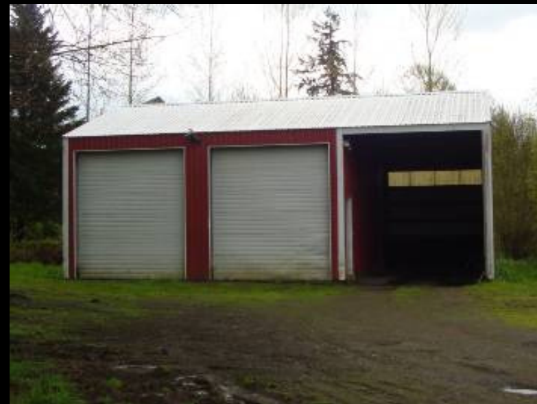
McCormick Barn, Ridgefield – c.1915