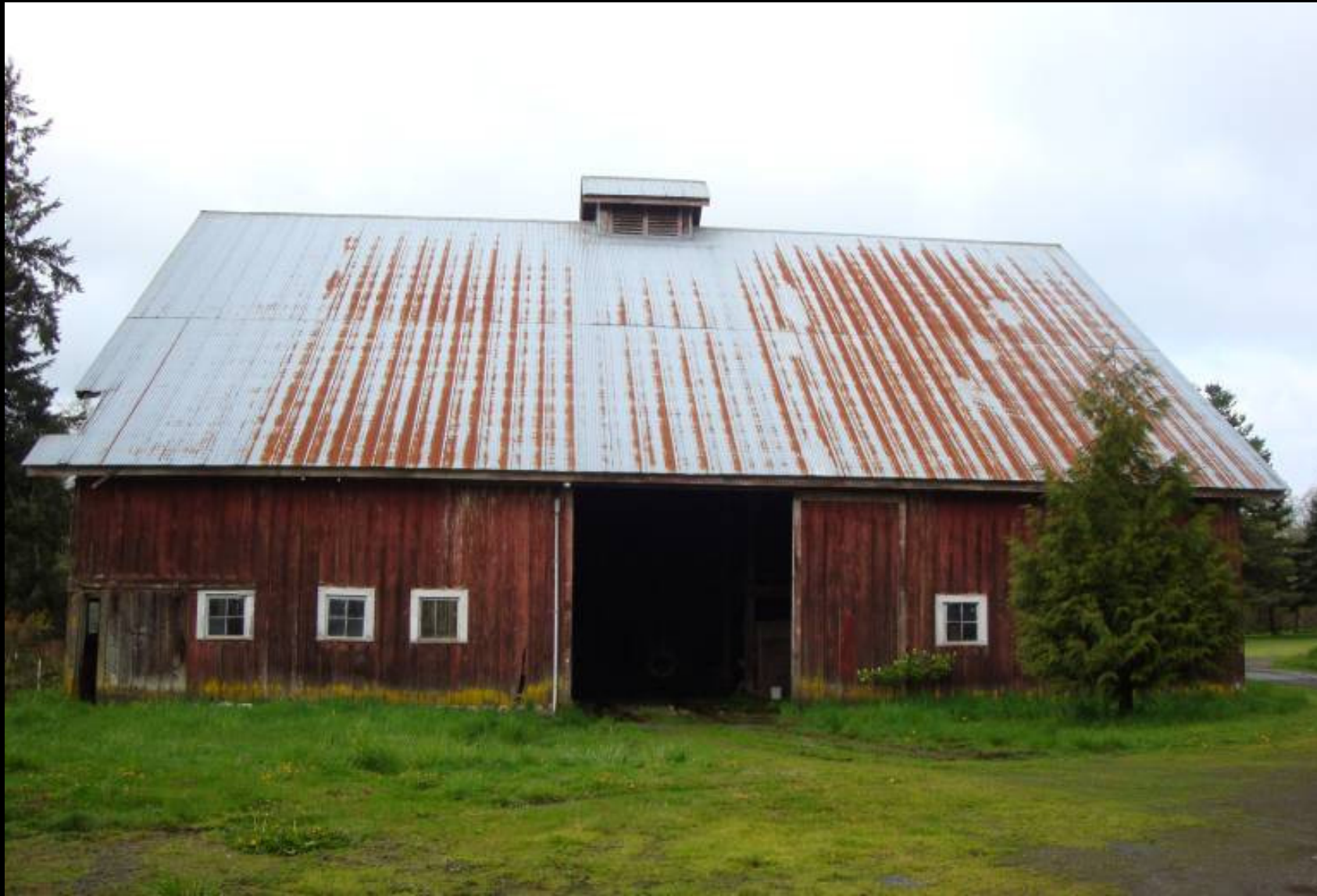
McCormick Barn, Ridgefield – c.1915