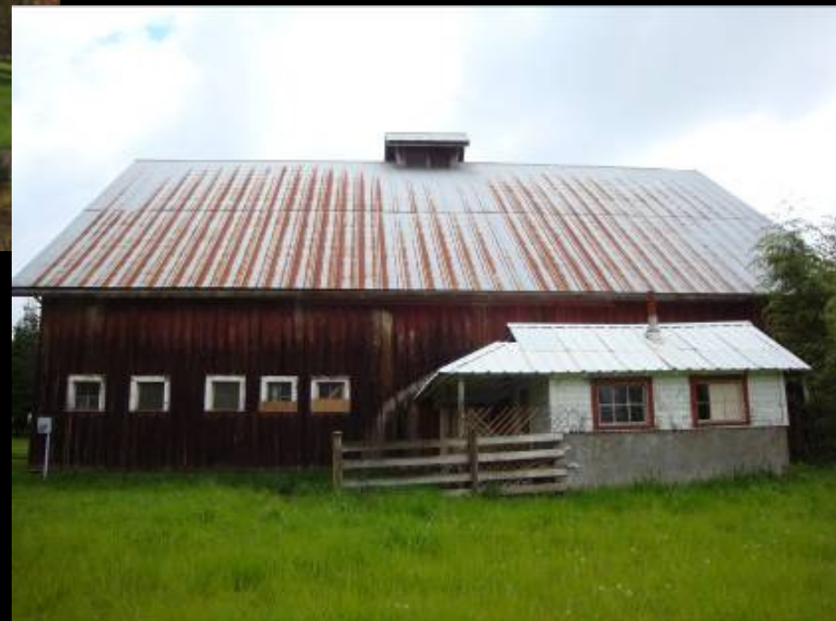
McCormick Barn, Ridgefield – c.1915