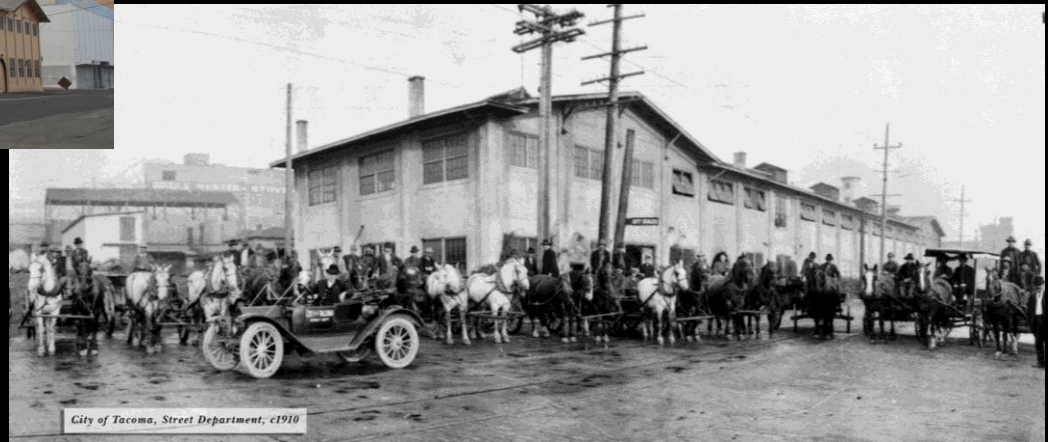
Tacoma Municipal Barn, Tacoma – 1910