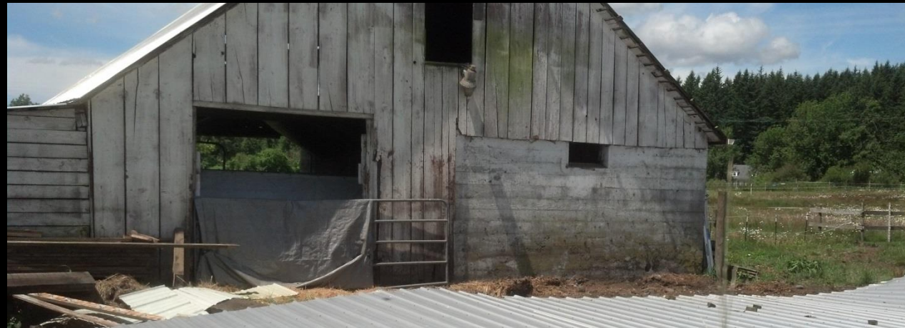
Cross Creek Alpaca Rescue, Tenino – 1914