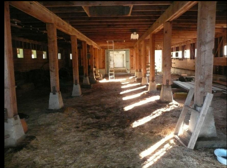
Topstall Farm, Roy – 1940