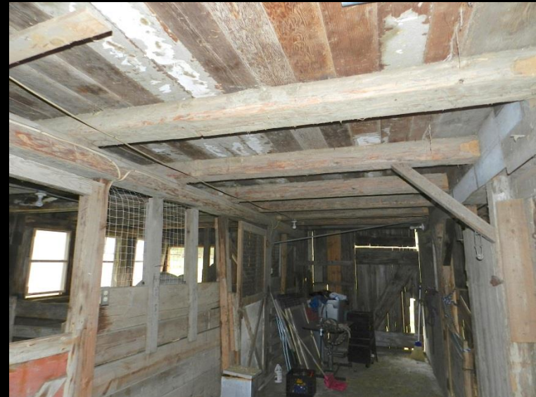
Schleipman Barn, Oak Harbor – c.1925