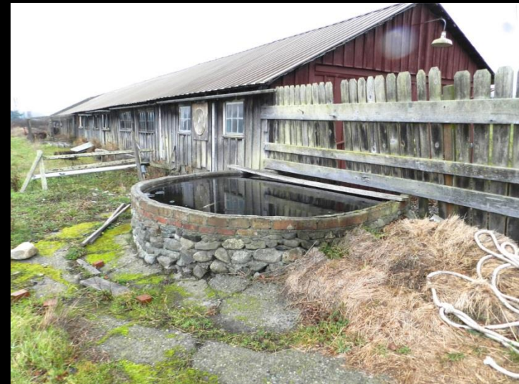
Dan Earlywine Farm/ Nienhuis Farm, Coupeville – c.1940