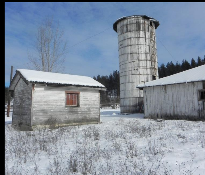
Hildenbrandt Ranch / Tawasentha Ranch, Colbert – c.1890