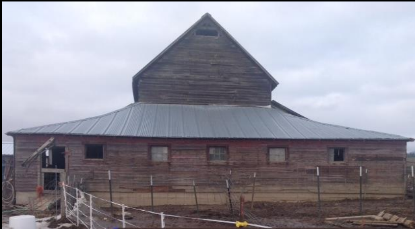
Stuart Farm, Elk – 1916