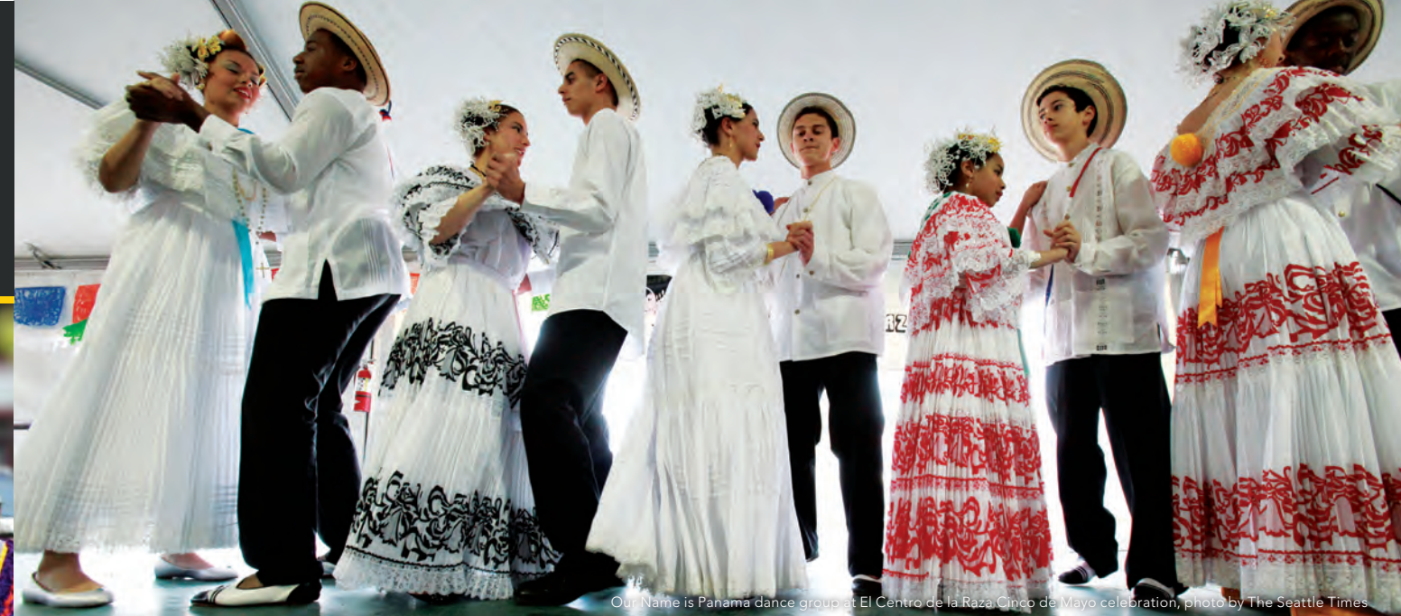
Our Name is Panama dance group at El Centro de la Raza Cinco de Mayo celebration, photo by The Seattle Times

SEATTLE CULTURAL HERITAGE GUIDES are a resource for visitors who want to explore the city's rich cultural heritage. Learn about museums, historic sites, public art and neighborhoods that will give you an insider's view of Seattle's vibrant ethnic communities and unique history.