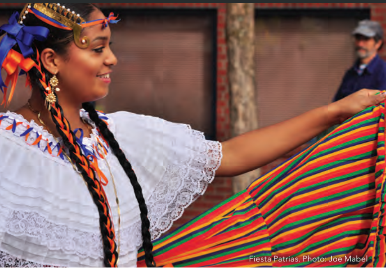
Fiesta Patrias.

MUSEUMS • PUBLIC ART • HERITAGE SITES • SPECIAL EVENTS