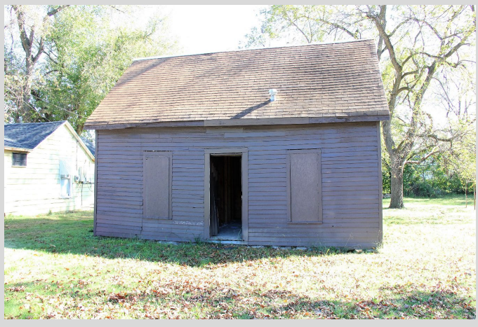
After initial rehabilitation work, c. 2016.

The National Register of Historic Places