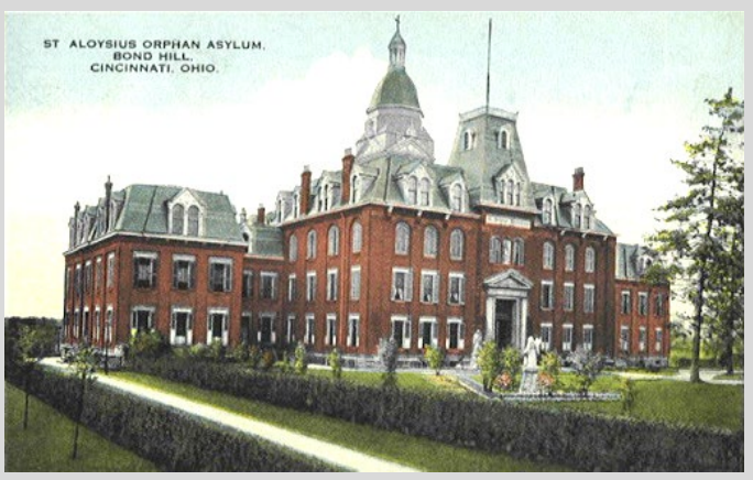
Postcard showing main building (1856-61) and wings (1869).

The nomination documents that in 1953, the building exterior's soft brick was deteriorating, and Perma-Stone was added. The color chosen closely matched the orphanage's 1923 limestone chapel. Although the application covered brick walls and stone lintels and sills, important character-defining features of the exterior design were maintained by the historic institution. In addition to the mansard roof with its cornice brackets and dormers, the pedimented entrance survives along with historic window openings. The historic context describes a major remodeling of the orphanage within the period of significance. As the area of significance is social history, not architecture, the original nineteenth century design was not the reason for listing, providing greater latitude in assessing integrity.