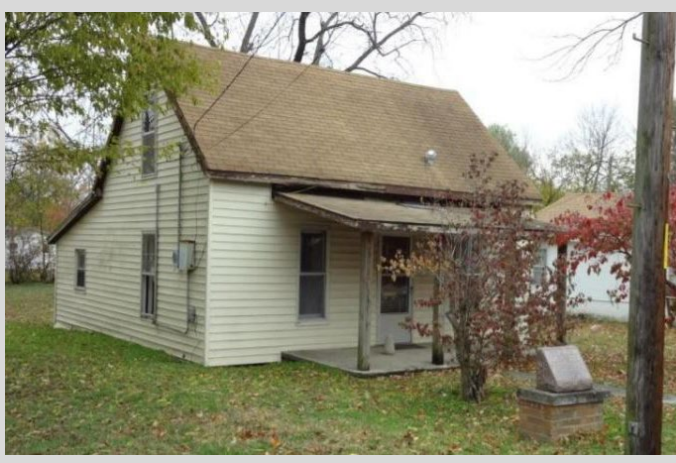
Before porch, lean-to, and contemporary siding removal, 2012.