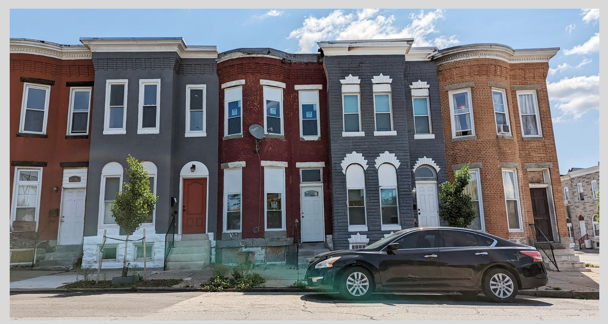
1300 block of N. Patterson Park, Baltimore, Maryland, 2022. The variety created by veneer stone and painted brick is typical.