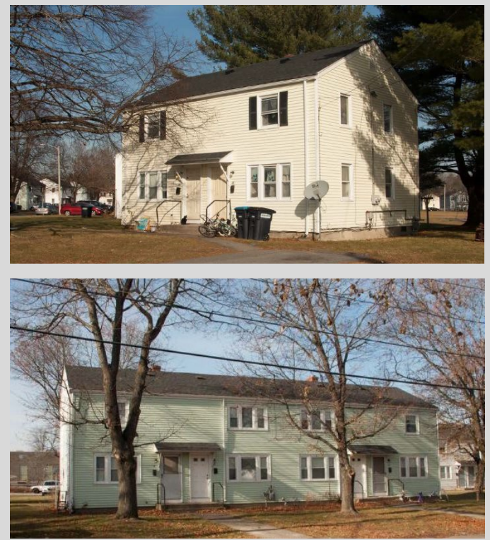
Typical housing types.

Constructed in 1942, all 90 apartment houses and the community building survive on the 29.5-acre site. In 1987, the Portland Housing Authority undertook a lead abatement program that entailed covering wood clapboard siding with vinyl siding. The Housing Authority also replaced all of the wood windows with wood/vinyl combination sash. As stated in the nomination, "[t]he character defining features of the Sagamore Village Historic District are identified in its spatial layout and repetition of forms. The similarity of scale, roof form, fenestration, plan and materials of all the buildings defines the district. The street layout, uniform housing unit setback, uniform side lots, open spaces and undefined lot lines identify the designed character of the district." Although every building has non-historic weatherboards, the survival of all the buildings in their original form and fenestration creates an intact representation of historic Sagamore Village.