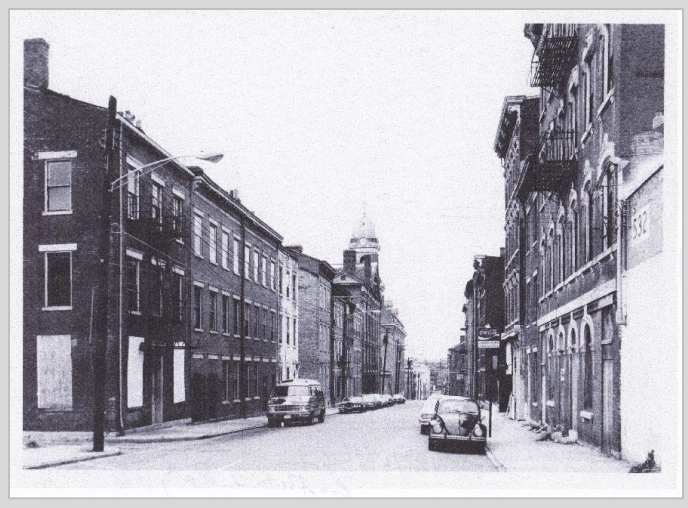
12th Street between Pendleton and Reading Road, 1983.