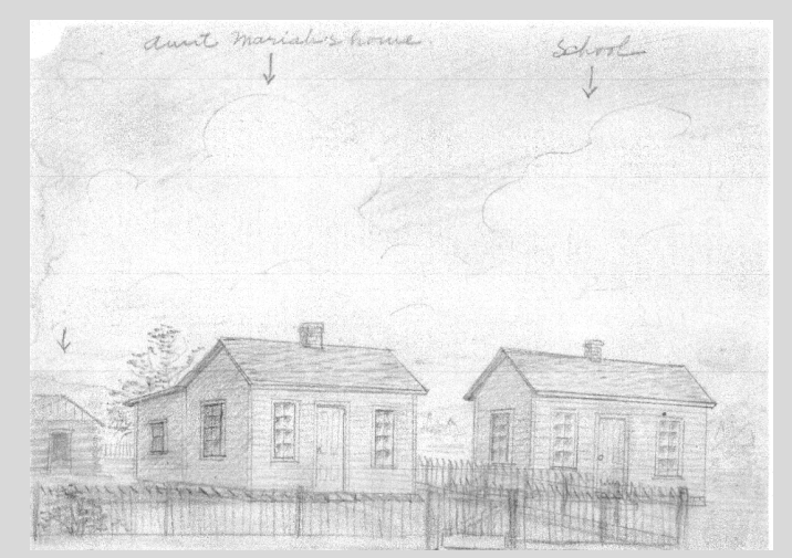
Sketch by George Washington Carver, c. 1939. The house on the left is no longer extant.

Because of the rarity of the resource and its ability to still convey its historic use as a school—due to its restored form and fenestration, and surviving wood siding—and as a rare surviving African American school that is also associated with George Washington Carver, the property was individually listed in the National Register in 2017.