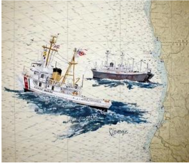
COMANCHE seizure of the first foreign ship in American Fishery Pacific Waters.

Comanche was the first US Vessel to issue a citation of violation of international fishing law in American waters. For twenty years Comanche worked in a multi-mission role, search and rescue and the protection of our Pacific Northwest marine resources. As your newly appointed Chief Science Officer I pledge to work tirelessly to preserve this rich history through our education work, and through ongoing practice.