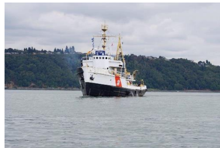
Same COMANCHE on the same day with two different paint schemes. WW-II camo and USCG stripe.