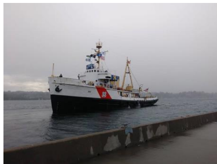
Comanche departs Bremerton Marina, October 1, 2018

A State of Washington and Federal IRS non-profit 503 (c) 3 since September 11, 2007