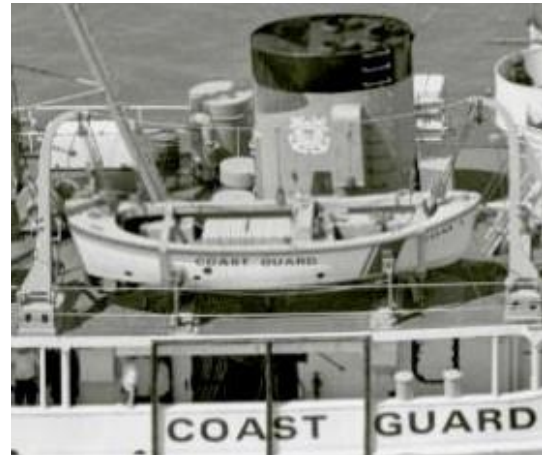
As one appeared on Comanche in the 1970s.

Also new to us and something we have long sought for is an engine room order telegraph. It's like the one that would have been used in Comanche engine room.