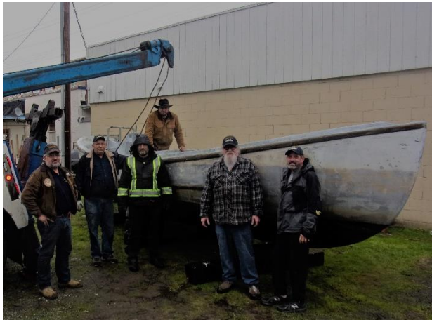
Our volunteers unloading the 26' motor whale boat. 1970s.