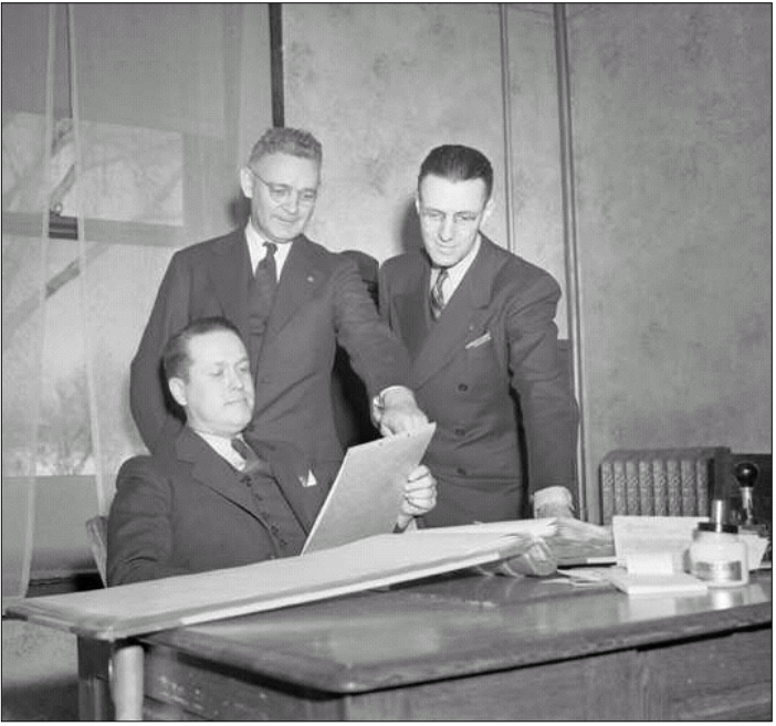
A well-framed motion is clear and easy for all to understand.

By presenting a clear and concise motion based on your community's design guidelines, you are better able to inform the public as to why you are approving, approving with conditions or denying a Certificate of Appropriateness and avoid misunderstandings and ill-feelings towards the commission and your community's preservation agenda.