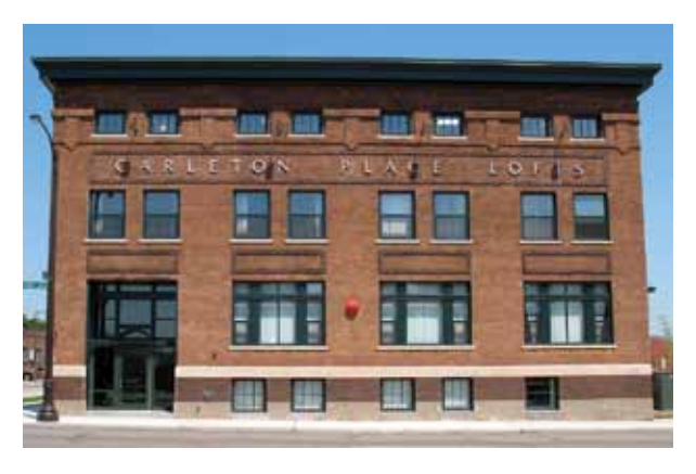
Carleton Place (historic name: Simmons Manufacturing Company), St. Paul, Minnesota (1909). Before and after rehabilitation for residential use.