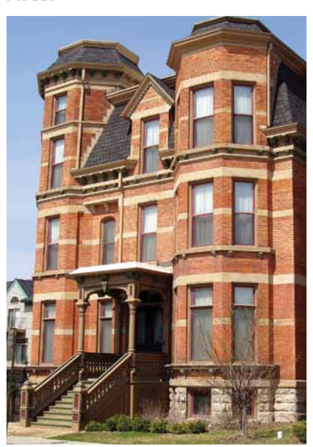
John Harvey House, Detroit, Michigan (1875). (opposite) Before rehabilitation; (above) After rehabilitation as a bed and breakfast.

limited partnerships, cannot be used to offset tax liability from "active" sources such as salaries. This passive activity limitation does not apply to: