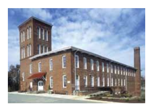
Prizery/R.J. Reynolds Tobacco Warehouse, South Boston, Virginia (1900). Rehabilitated for commercial use.

The NPS or the SHPO may inspect a rehabilitated property at any time during the five-year period. The NPS may revoke certification if work was not done as described in the Historic Preservation Certification Application, or if unapproved alterations were made for up to five years after certification of the rehabilitation. The NPS will notify the IRS of such revocations.