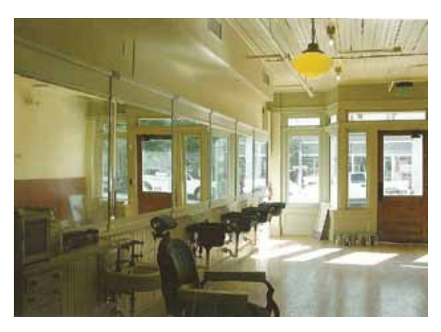
Odd Fellows Building, Raleigh, North Carolina (c. 1880). Rehabilitated for continued commercial use.