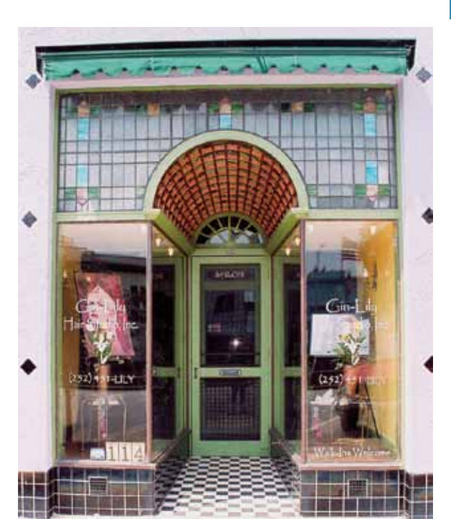
114 NW Main Street, Rocky Mount, North Carolina (1928).