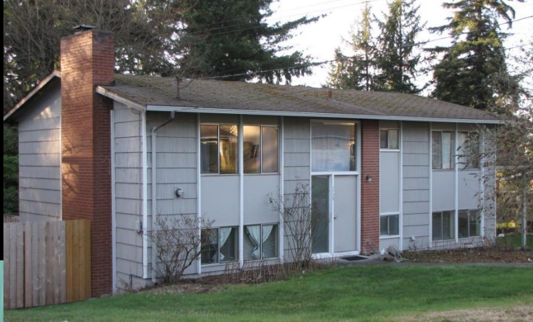
House Bellevue, c.1968