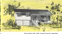
Elevation B with lower level garage