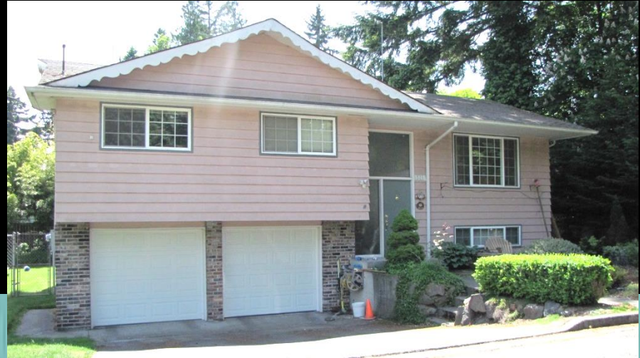
House Lynwood, c.1972