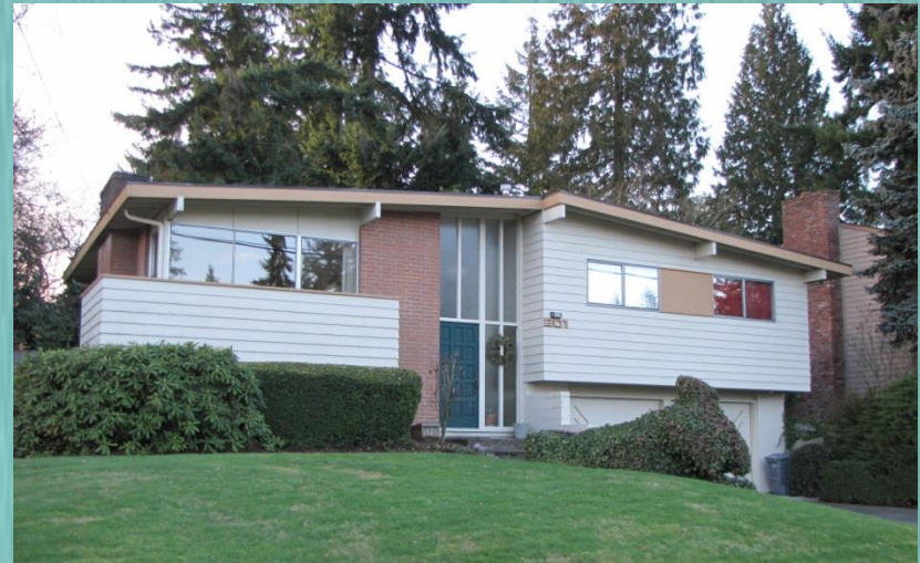
"Riviera" Model Home Bellevue, c.1958