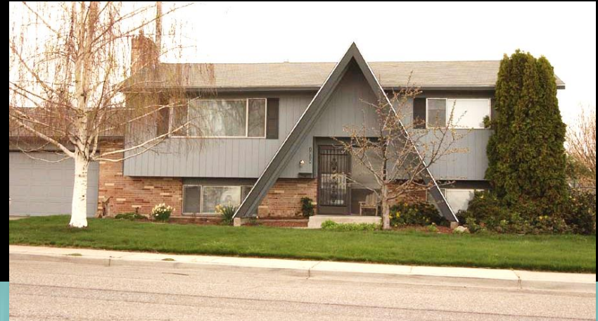
House Richland, c.1975