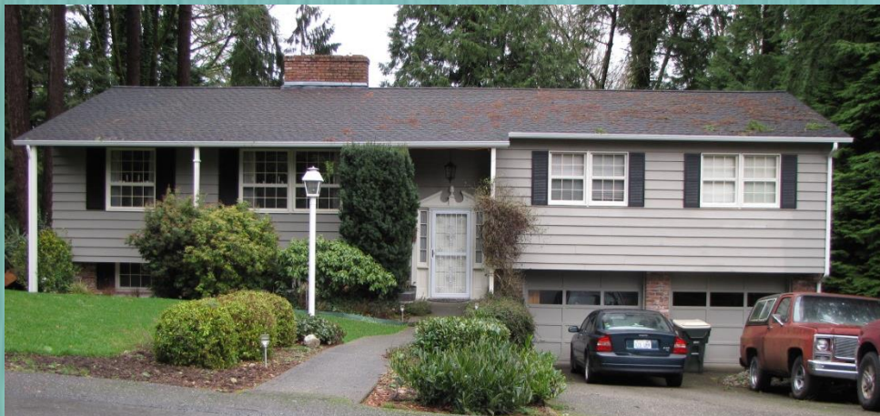
House Olympia, c.1970