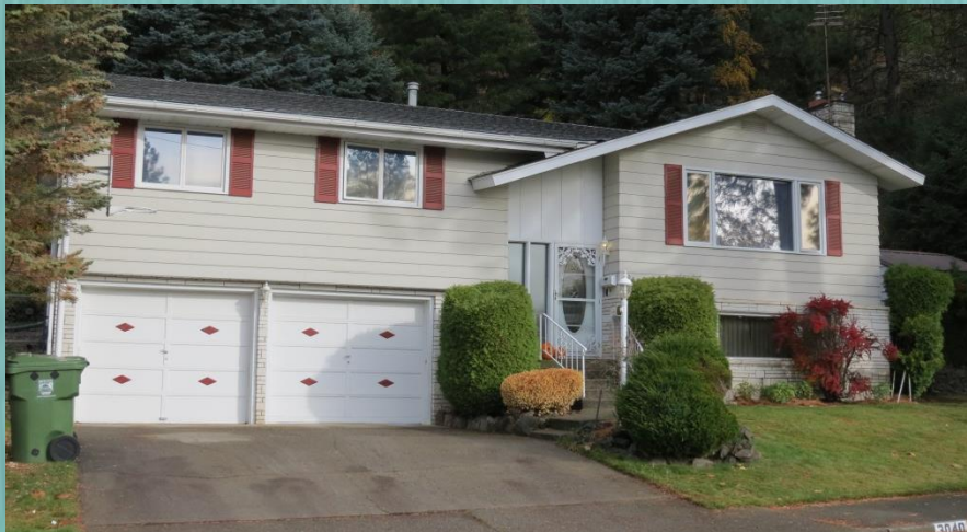
House Spokane, c.1975