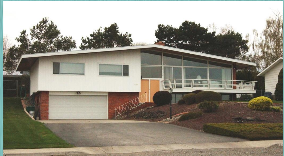
House Kennewick, c.1965