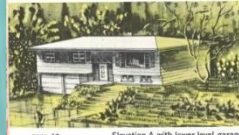
Elevation A with lower level garage