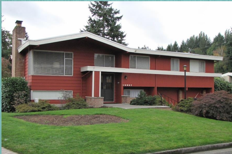
House Bellevue, c.1968