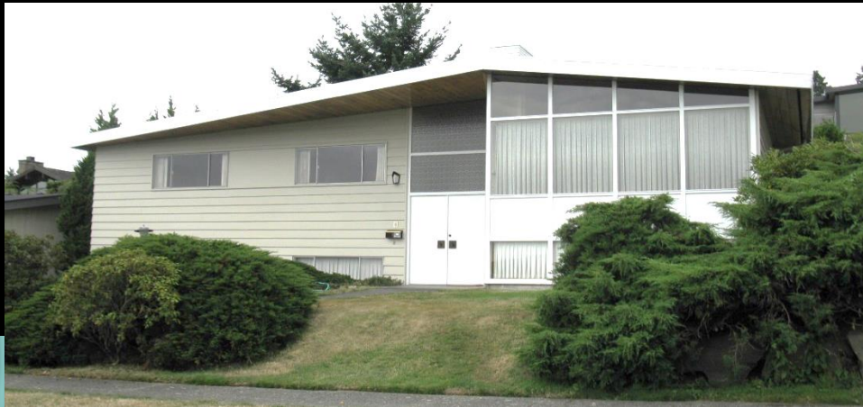
House Seattle, c.1968