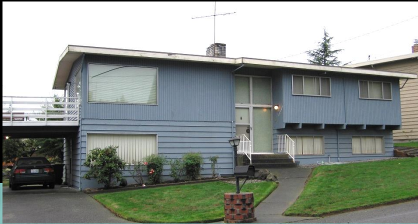
House SeaTac, c.1968