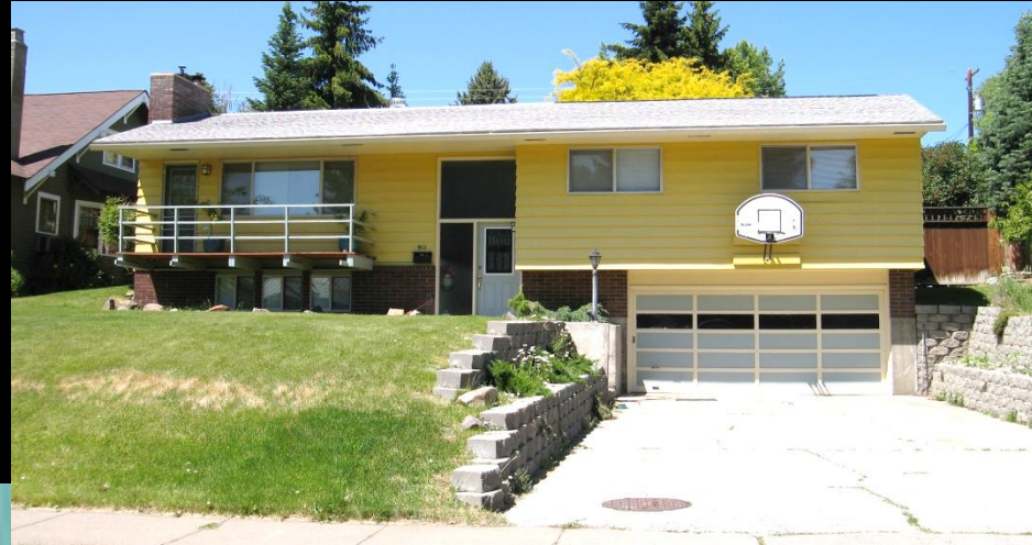
House Ellensburg, c.1969