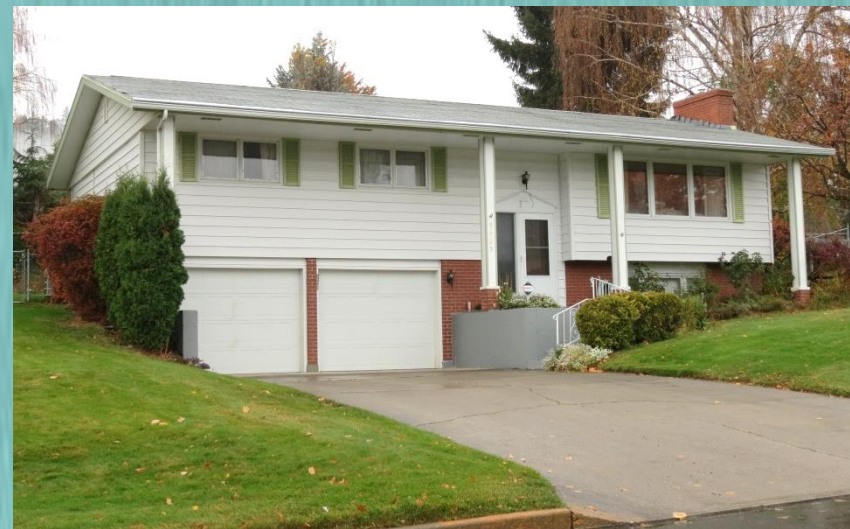
House Spokane, c.1965