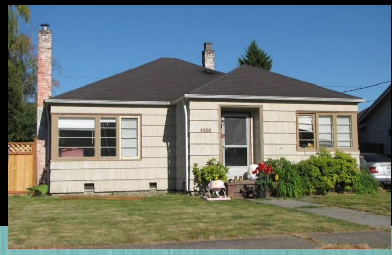
House Mount Vernon, c.1949