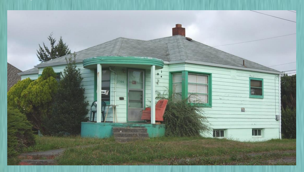
House Bremerton, c.1943