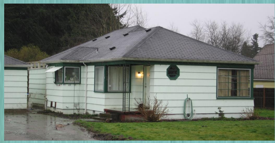
House Longview, c.1945