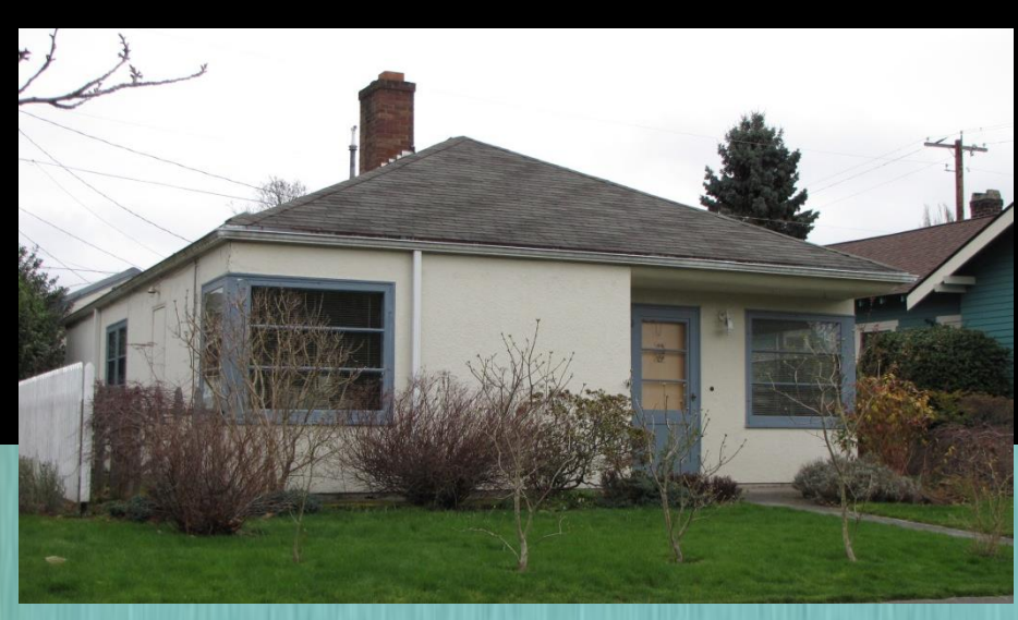
House Bellingham, c.1946