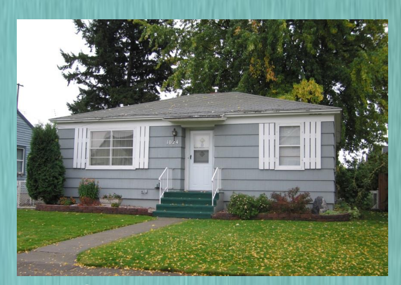
House Spokane, c.1949