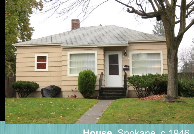
House Spokane, c.1946