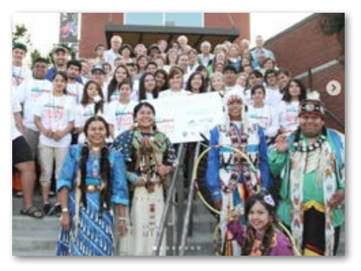
Yakama Nation tribal partners with Youth Heritage Project participants.

(AKCHO), and Historic Tacoma. Others focus on specific historic places such Friends of Seattle's Olmsted Parks, The Historic Trust in Vancouver (focused on preserving Providence Academy), and the Yakima Interurban Lines Association, dedicated to maintaining the former Yakima Valley Transportation Co. streetcar system. Also worth noting here are Main Street organizations now found in 65 (mostly rural or suburban) communities throughout the state. Last, but certainly not least, historic preservation stakeholders include many individuals from all backgrounds having an active interest in preserving heritage to foster the wellbeing and vitality of their communities .