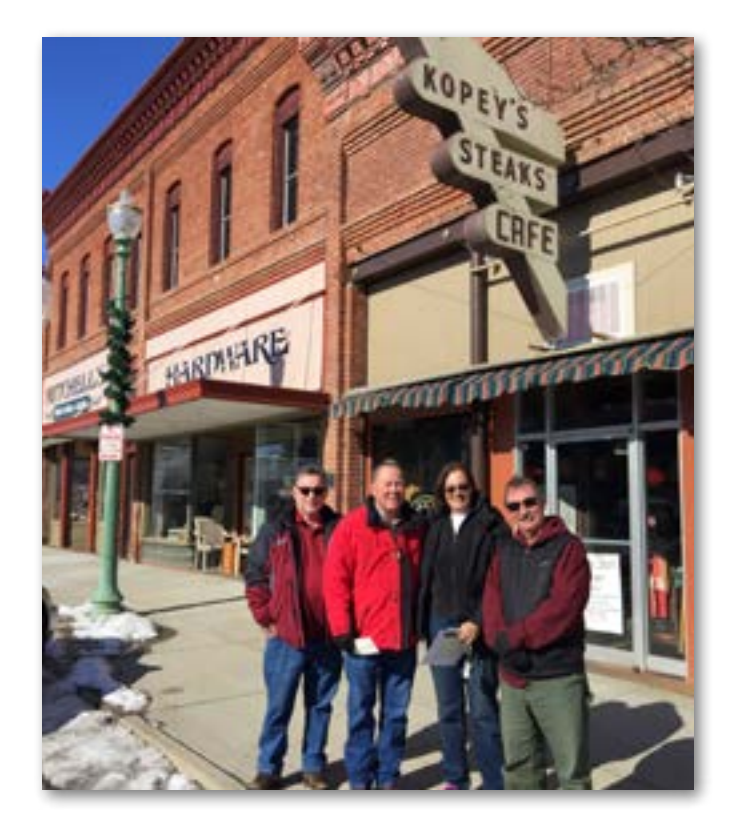
Main Street partners in Waterville, WA