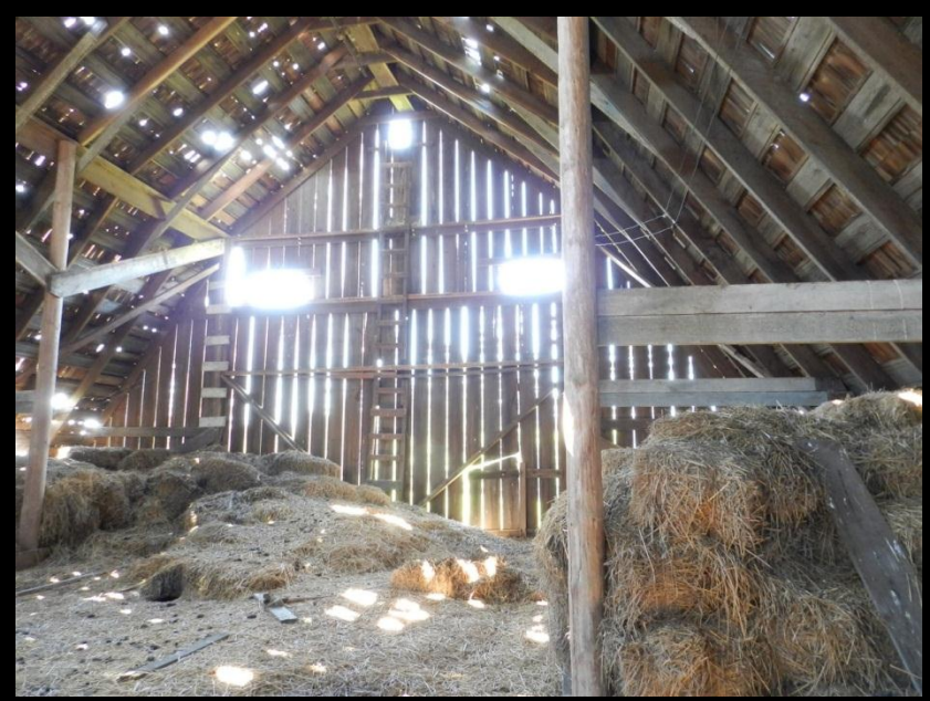
Comstock Barn, Coupeville- 1935