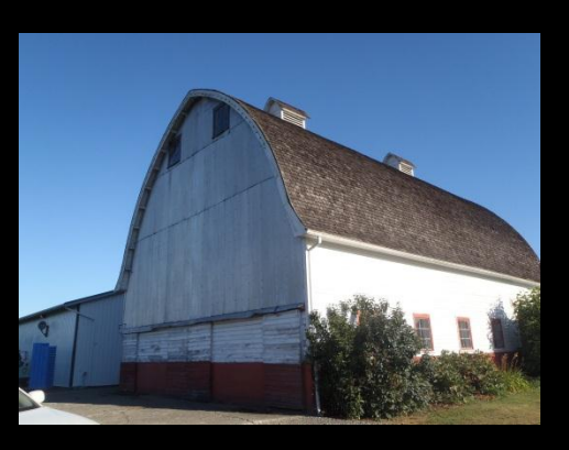
Broers Farm, Monroe – c.1935