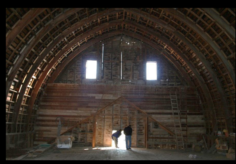
Lauritzen Farm, Wilbur – 1918