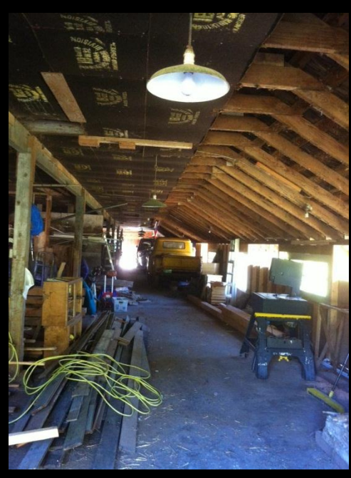
Kelsey Family Farm, Brush Prairie – 1959