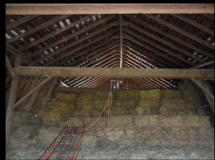
JKTJ Courtney Herefords, Lynden – 1912