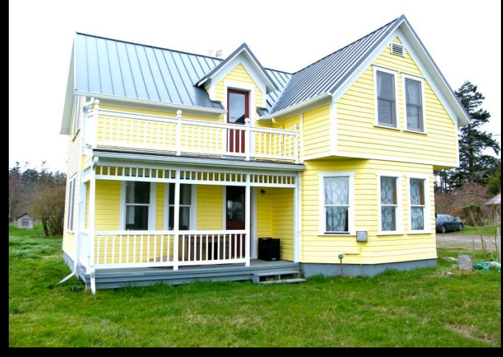
Rosehip Farm, Coupeville – c1895