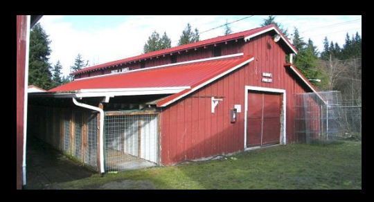
Island County Fairgrounds, Langley – 1937