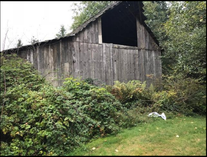
Eaton Mt. Ranch, Enumclaw – 1949