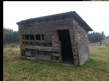
Ruehm Farm, Colville – c.1910