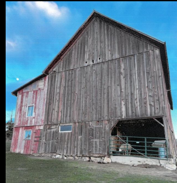
G.L. Van Leuven Farm, Mead – 1888