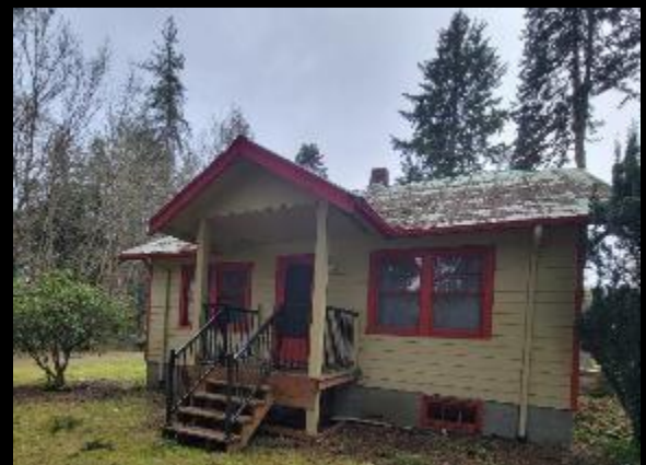
Highland Dairy Farm, Clinton – c.1950