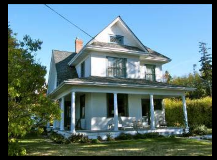
Jenne Farm, Coupeville – 1908