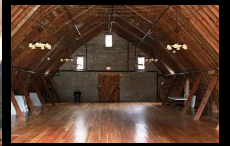
Mottler Barn, Leavenworth – 1944