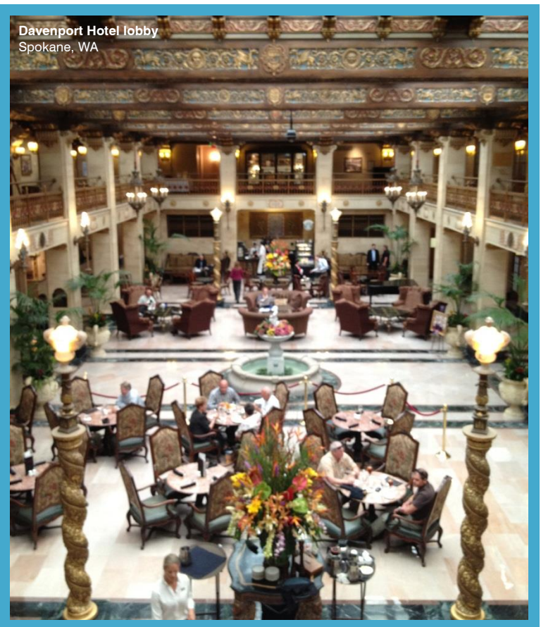
Davenport Hotel lobby Spokane, WA

The Special Valuation program is reviewed locally by Historic Preservation Commissions in Certified Local Government (CLG) communities.