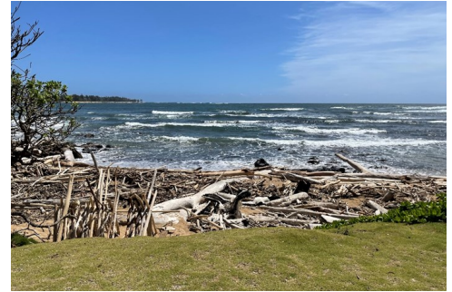
Lydgate Beach Park, April 2024

As the Regional Environmental Officer, I pledge to assist you in understanding and complying with all applicable environmental and historic preservation requirements.